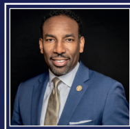
MAYOR ANDRE DICKENS City of Atlanta