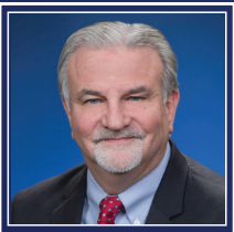
Mayor Alan Hallman