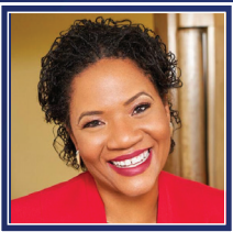
Mayor Deana Holiday Ingraham