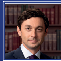
Senator Jon Ossoff