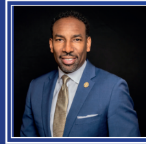
Mayor Andre Dickens