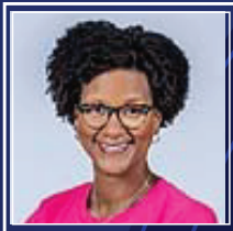
Mayor Bianca Motley Broom